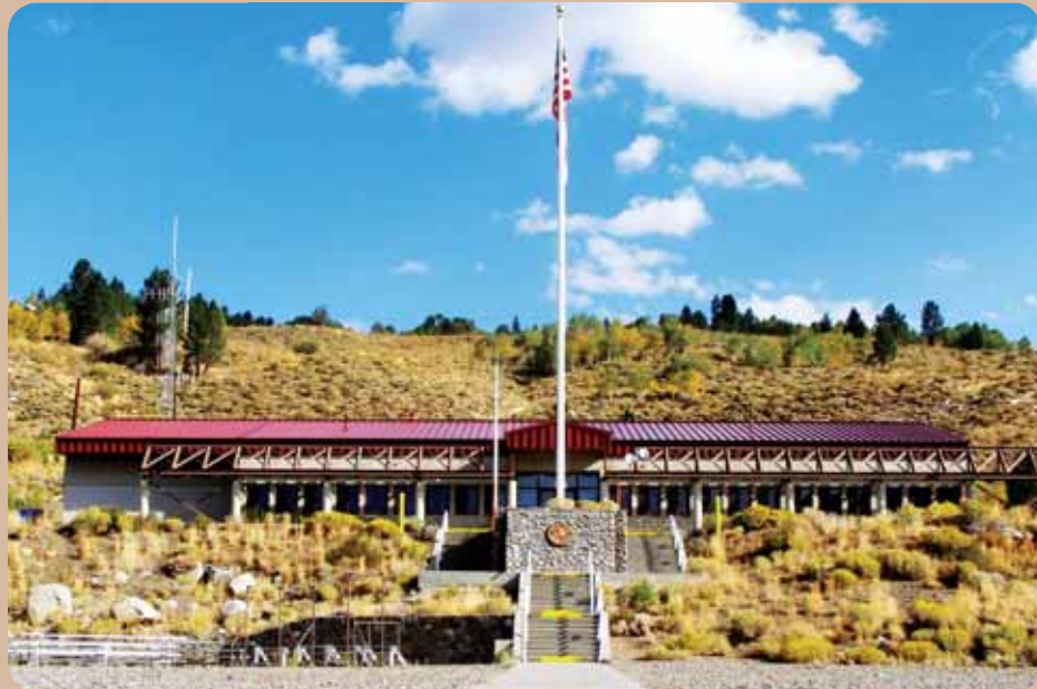
Marines, Sailors and family members of the Marine Corps Mountain Warfare Training Center,

I hope you are all doing well. The summer moves are over and we have bid farewell to many and welcomed new people to our wonderful Eastern Sierra mountain paradise. The summer has, of course, been too short and now winter is knocking on our door again. So it is time to make sure your vehicles are in good working order, to include good snow tires and windshield wipers. Also, make sure you have tire chains or cables in your vehicle and that you and your driving-age family members know how to install them.